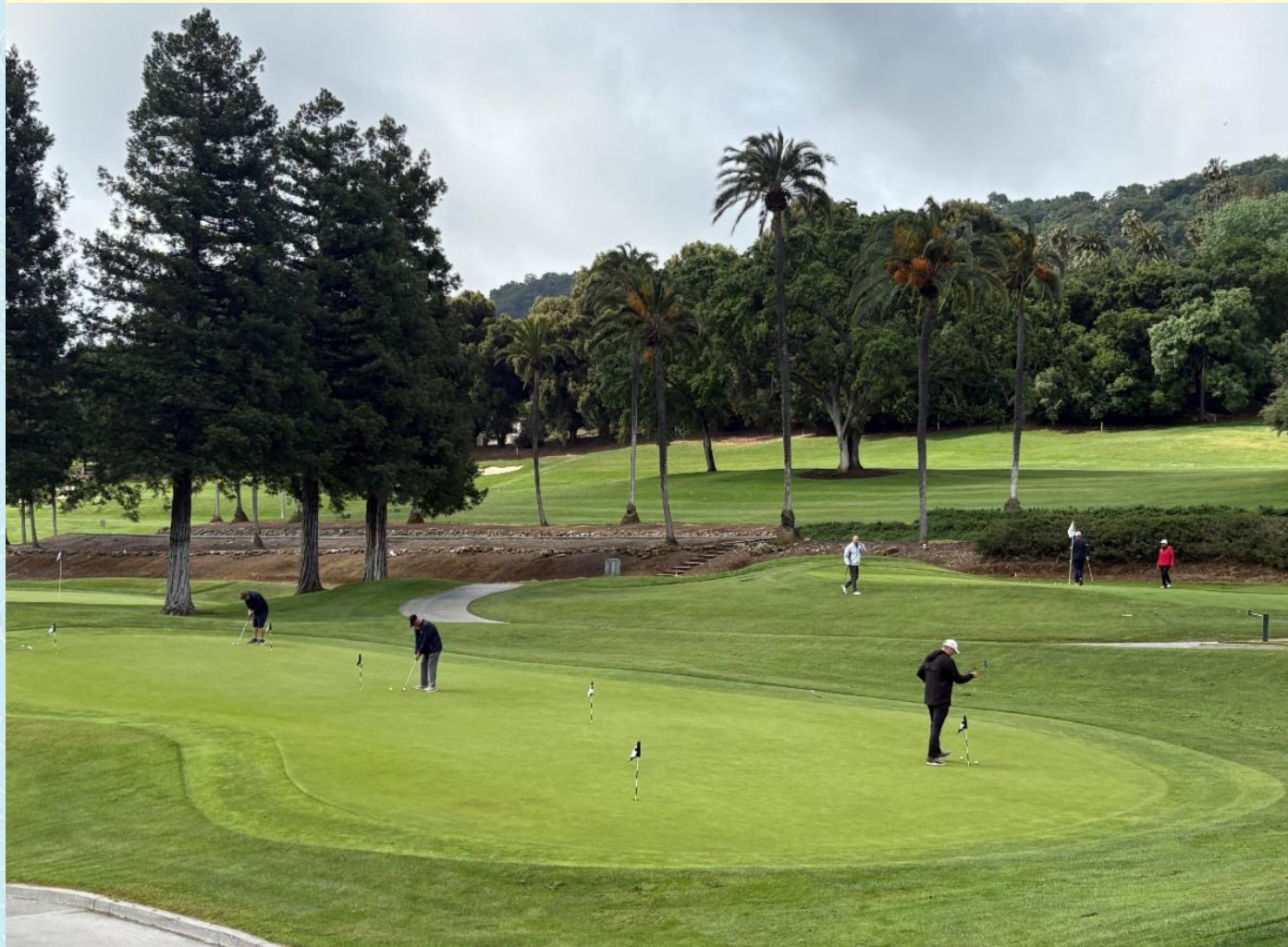
Pic: Putting green at the 38th Annual Golf & Bocce Tournament held on May 12, 2025 at the Club at Castlewood

Furthering the mission of Washington Health since 1983