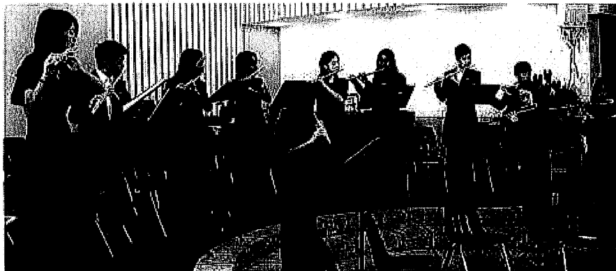
The flute choir for Bay Philharmonic Youth Orchestra plays autonomously without a conductor.

PROPOSED SIGNATURE (street address omitted for privacy reasons) Proponent, CA 94538 PROPOSED ADDRESS November 12, 2024 RTB THE GILBERT NAME OF PROponent PROPOSED SIGNATURE (street address omitted for privacy reasons) Proponent, CA 94538 PROPOSED ADDRESS November 12, 2024 RTB 11/7/24 C93.3876155M